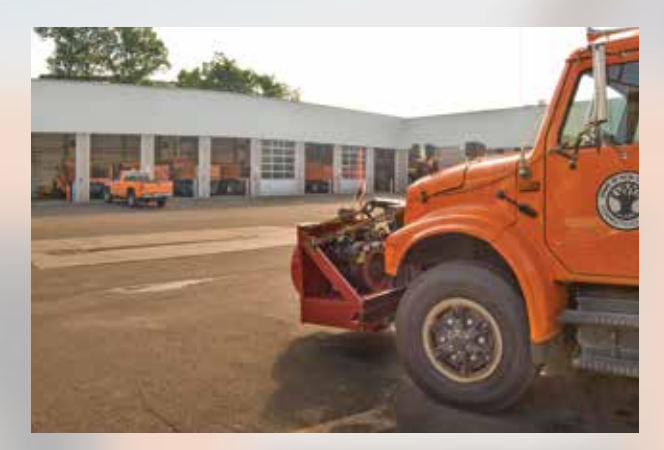
New Canaan Public Works