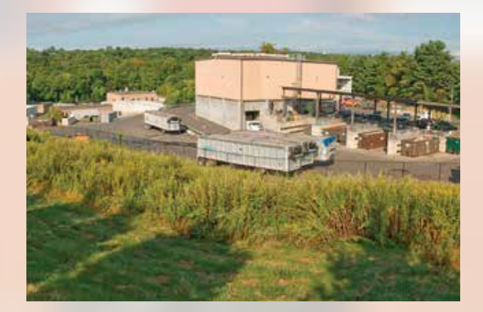
New Canaan Transfer Station