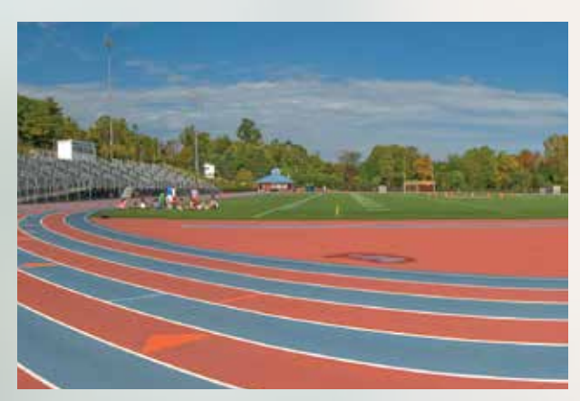
Danbury High School Track