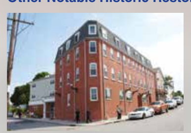
The American Legion Veterans Housing, Inc (TALVHI)