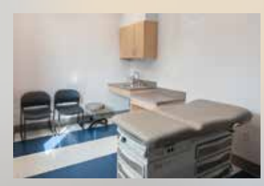
Southwest Community Health Center – Medical