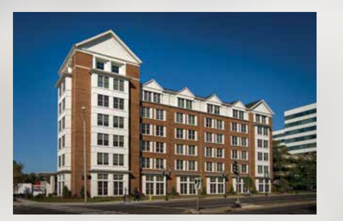
Post House Apartments