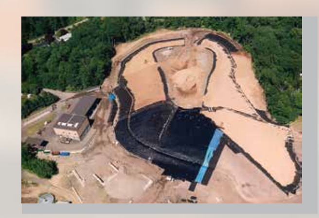
New Canaan Landfill